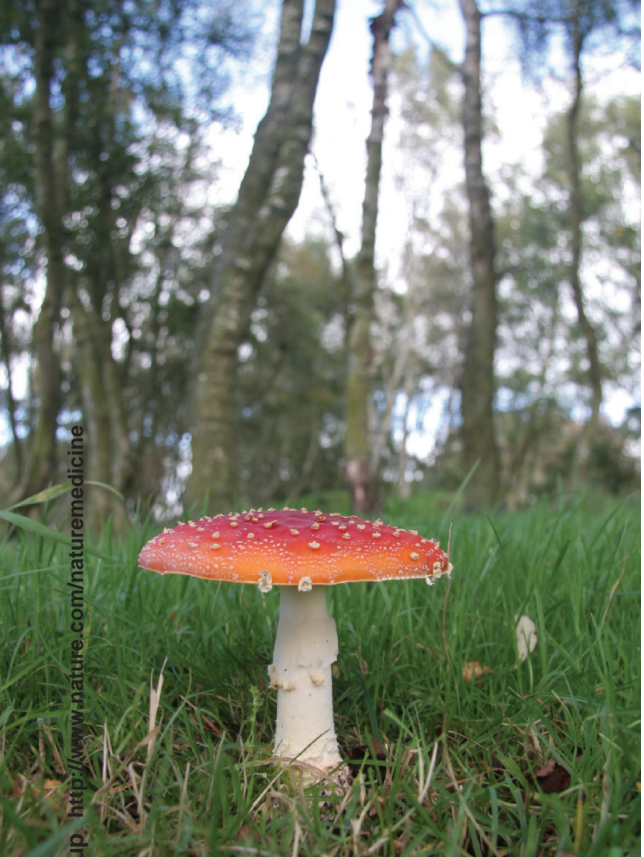
Psychedelic cure: Many with cluster headaches have turned to LSD and magic mushrooms.

at bay. If a headache did force its way through, small doses of mushroom tucked under the tongue could sometimes abort an attack in just 15 minutes.